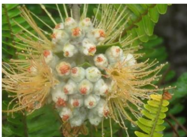
'Ōhi'a Lehua 'Alani 'o Kūkaniloko