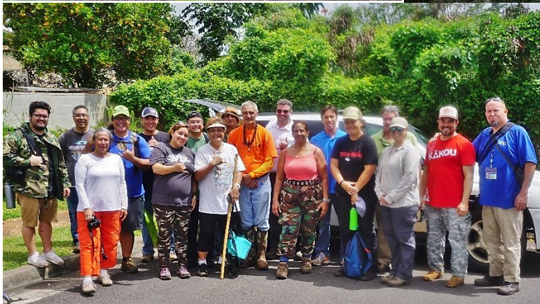
Upper Kipapa Stream, Kipapa Valley, Ahupua'a 'o Waipi'o