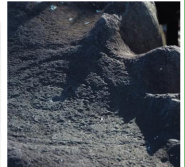
3.21.2k17 Photo credits na Kalimapau