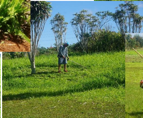
Today's weed whacking crew...